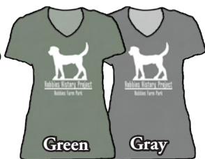
Women's Shirt Sizes (V-Neck)

BODY LENGTH: Lay garment flat (face down). Measure from center back neckline seam straight down to bottom of the front hem.