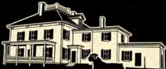
Robbins Mansion & Dog, 1936