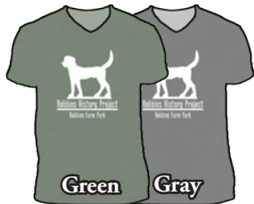
Men's Shirt Sizes (V-Neck)

Note: Shirts to be produced when sufficient quantity of orders are received.