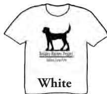
Youth Shirt Sizes (Crew Neck)

FULL BODY LENGTH: Lay garment flat (face down). Measure from center back neckline seam straight down to back bottom hem.