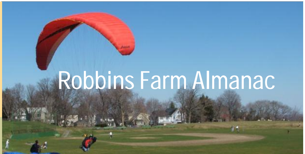
Paraglider in the Park