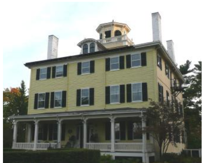
Whittemore Robbins House - Site of the upcoming 10th Anniversary Celebration