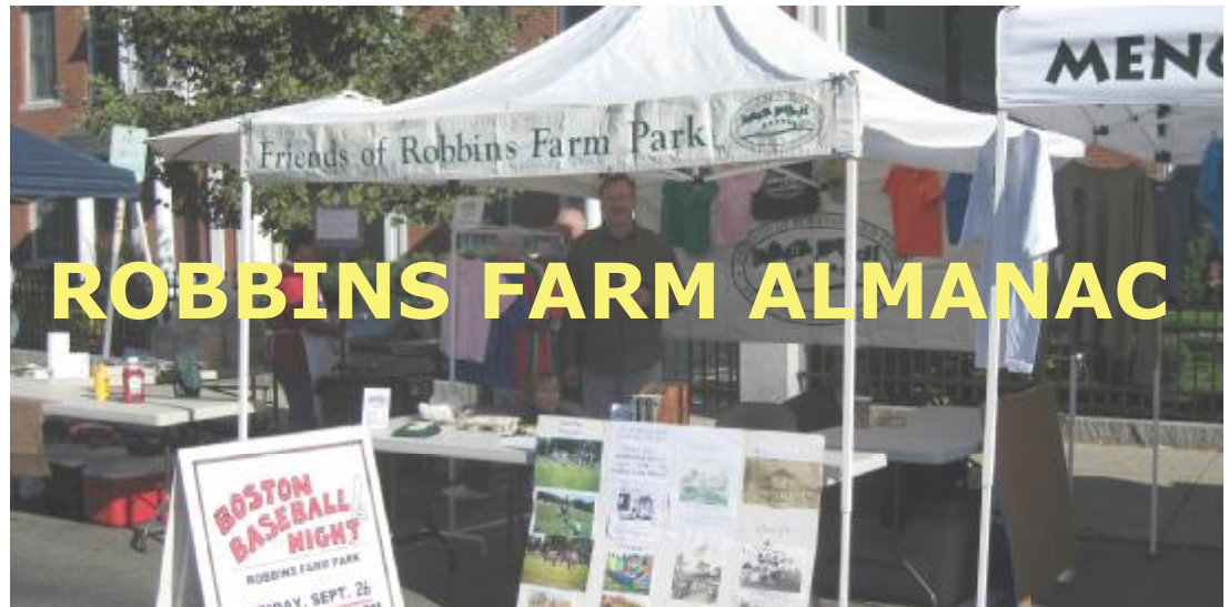
Town Day 2008