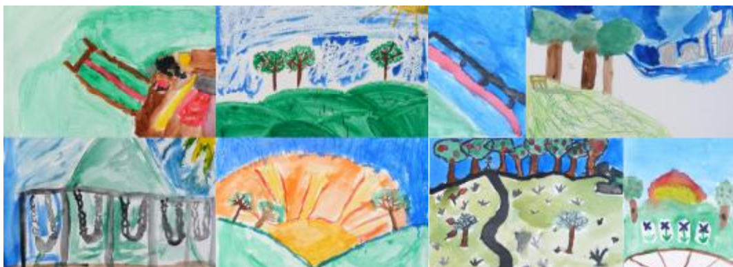
On the first Friday of each month, the Brackett Visual Arts Enrichment Committee (better known as the "Art Squad") leads hands-on creative art making after school. Last October, the kids painted images of Robbins Farm Park. These are just some of their park-inspired paintings.