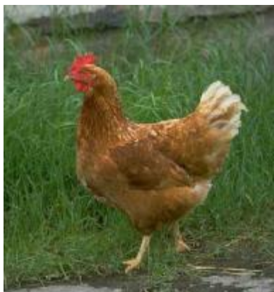
Will chicken culture ever return to 21st century Arlington?