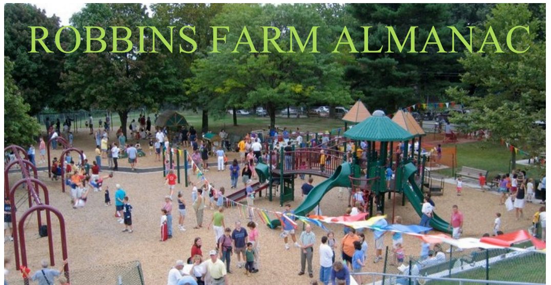
Newsletter of the Friends of Robbins Farm Park