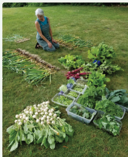
Collecting the Harvest