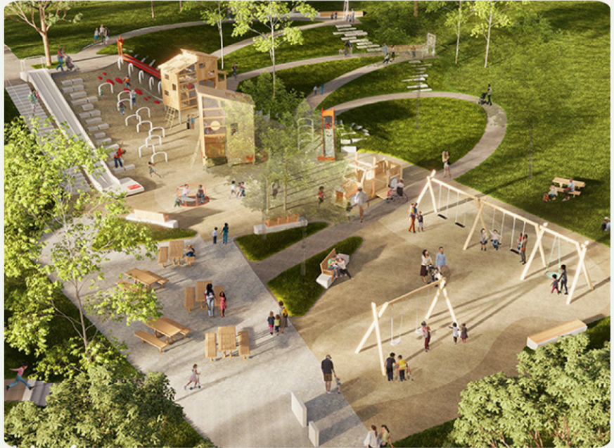
Rendering of Final Playground Design by Agency Landscape + Planning