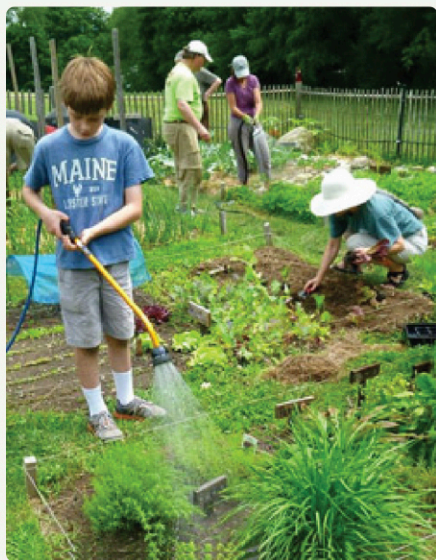
Watering the Garden

First proposed to the Arlington Department of Parks and Recreation in 2009, the Robbins Farm Cooperative Teaching Garden is now in its 13th growing season! The current garden footprint, located at the downhill end of Robbins Farm Park, is twice its original size with an evolving design now featuring wider paths for the requisite garden tours. The all-organic garden is run cooperatively so there are no assigned garden plots. To support our mission as a teaching garden, we maintain two distinct gardening websites: robbinsfarmgarden.org for teens/adults, and veggieschool.robbinsfarmgarden.org for grade school children.