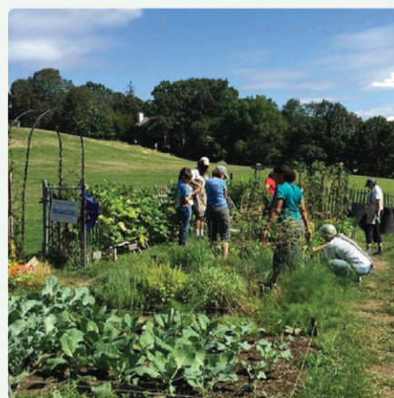
The Robbins Farm Gardeners

I recall an especially rewarding day when a mother was visiting the garden with her 4 year old son. The boy seemed particularly interested in the abundance of cherry tomatoes ripening on their vines. When I offered one to the boy for tasting, his mother said, “oh, he really doesn’t like tomatoes.” Well, the boy popped that little gem in his mouth, chewed, smiled, swallowed – and then asked for another! His mother stood there, her mouth agape! There’s nothing quite like a nicely