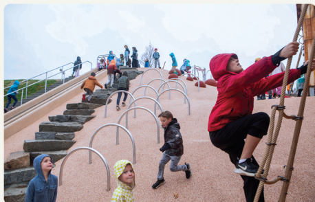
A New Hill to Climb