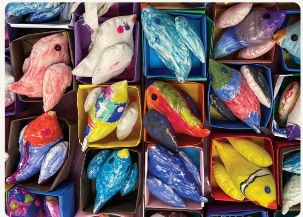
Bird Making Art Projects

What birds can you hear and see in the park?