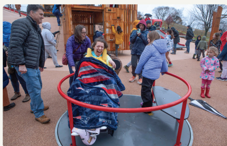
First Spin of the Carousel

On November 23rd 2024, an opening in the construction fence was created, a red ribbon cut, and a pack of happy kids cheered and descended upon the newly renovated playground. After more than two years, even a cold rainy morning couldn't dampen their enthusiasm. Since then, the playground has been full of families, rain or shine!