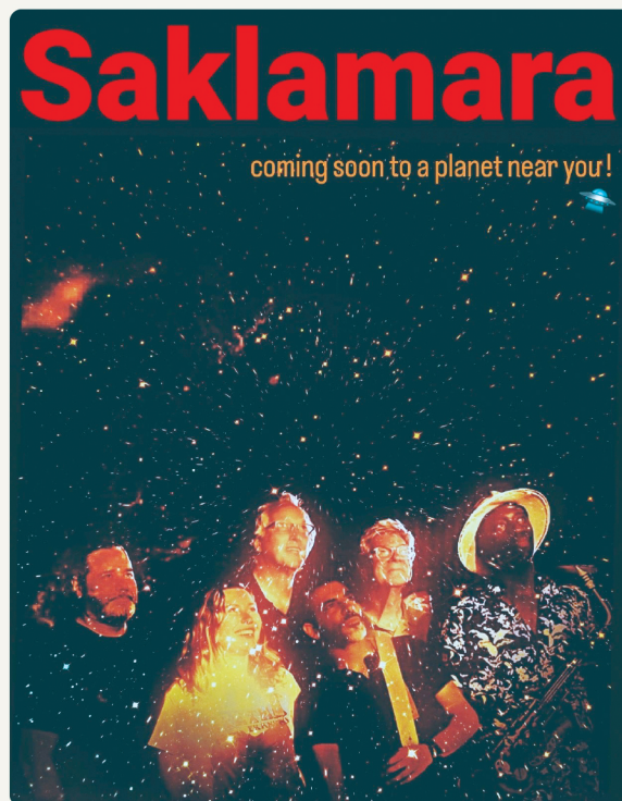
The Band Plays the Park on July 19th!

We're thrilled to welcome Saklamara to Rockin' Robbins this summer. Bring a blanket, pack a picnic, and take in the irresistible sounds of Saklamara! For more about the band go to www.saklamara.com/