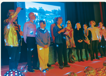
FORFP Receives ACA's McClennen Award

Copyright © 2025 Friends of Robbins Farm Park