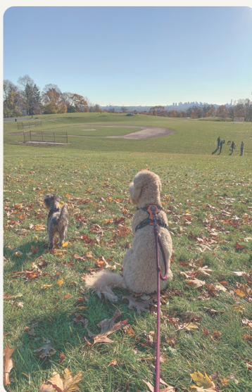
Dog Days at the Park