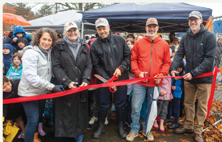
The Ribbon Cutting!