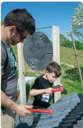
Music in the Playground

night sky events, playing sports, gathering with friends and dogs, or simply enjoying the view of Boston. The Friends of Robbins Farm Park is a volunteer-run organization. If you'd like to help at events or consider joining the board, I'd love to hear from you!