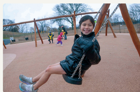
Hurray for the First Day!

To everyone who donated, spread the word, or supported this project in any way - thank you for helping build not just a playground, but a more inclusive community for all our children.