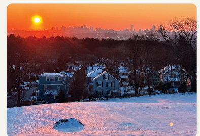
Sunrise over a Snowy Robbins Farm Park